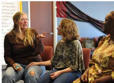
Let Talker Be the Guide