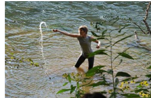
Stay With Yourself