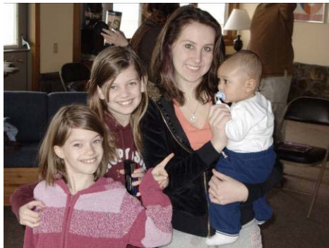
Mutual Responsibility and Accountability