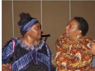
Diversity of Insights